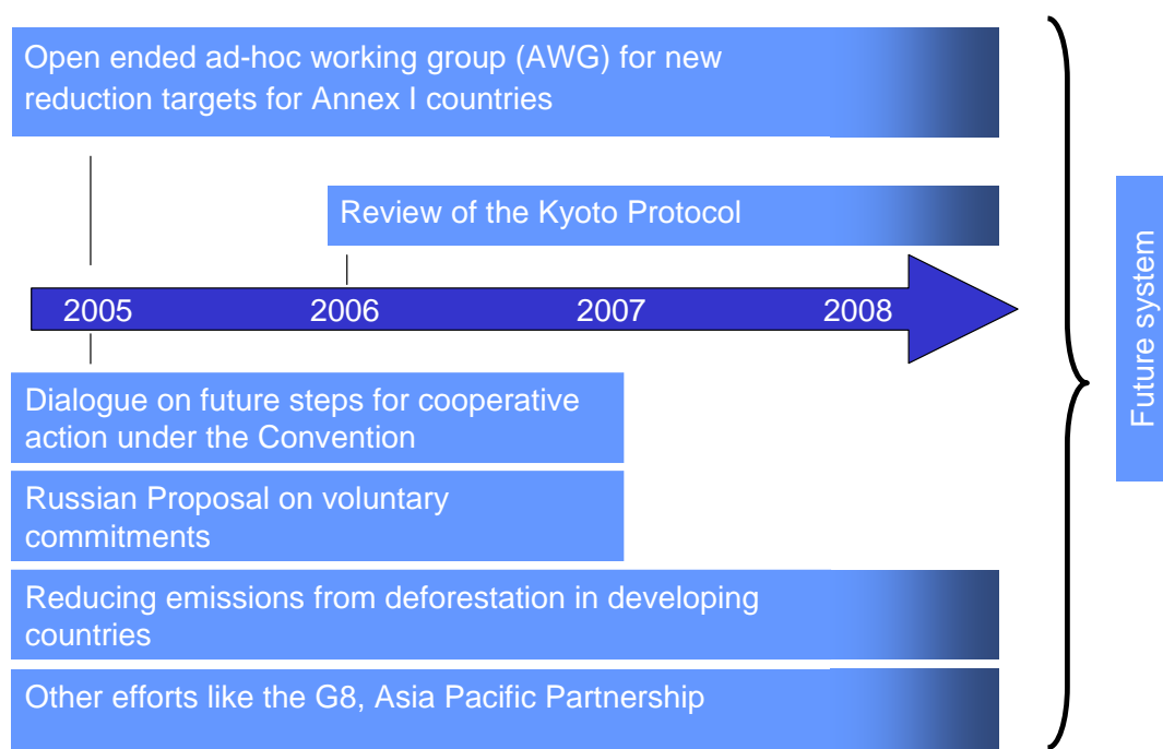
Figure 3. Overview of different strands of activities relevant to future international climate policy